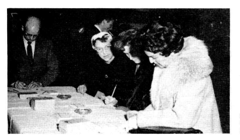
More than 365 people registered for the Annual Convention and the Auxiliaries Meeting. In addition 60 people participated in the Small Hospital Seminar.

The President's Reception was attended by 150 people who had an opportunity to renew old acquaintances, make new friends, and enjoy an informal get together.