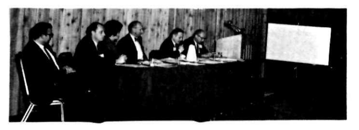
DISCUSSION LEADERS AT THE SMALL HOSPITAL SEMINAR

Each seminar discussion group and its leader discussed some of the difficulties they are faced with establishing a continuing education program. The small hospital seminar closed the 1966 Annual Meeting of the Wisconsin Hospital Association.