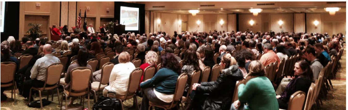
Attendees at the 2013 National Healthcare Coalition Conference

WHEPP, a program administered by DHS in partnership with WHA and other stakeholders, supports hospital emergency preparedness planning and response to mass casualty incidents and other emergencies. WHEPP is funded in substantial part by a grant from the Office of the Assistant Secretary for Preparedness and Response (ASPR). In a recent trend, the ASPR grant guidelines are pushing grantees, including WHEPP, into expanding the role of health care coalitions in emergency preparedness capabilities, including disaster response and recovery, monitoring and management of resources, and coordination of emergency medical care resource allocation.