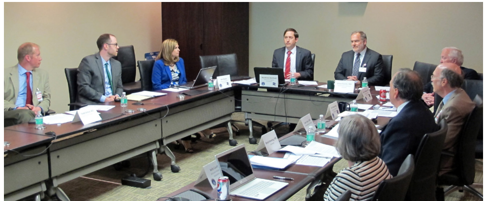
The Physician Leaders Council meeting May 11