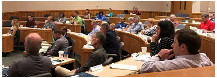
WHA staff and members at the 2018 WHA Board planning session