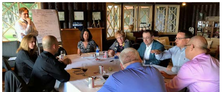
Breakout sessions at WHA’s 2018 Board Retreat