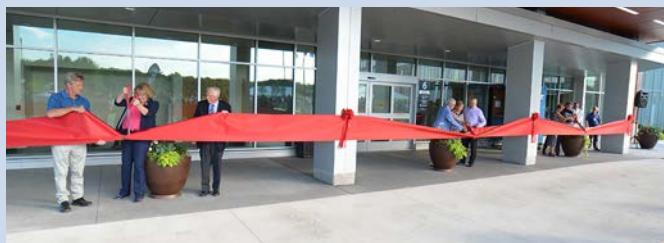
Bay Area Medical Center Board members at the ribbon cutting ceremony. The new facility has been 10 years in the making and opens August 16.