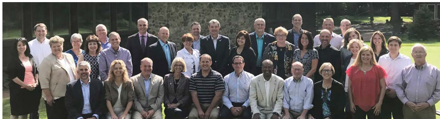
WHA's Board Retreat, July 18-20, 2018