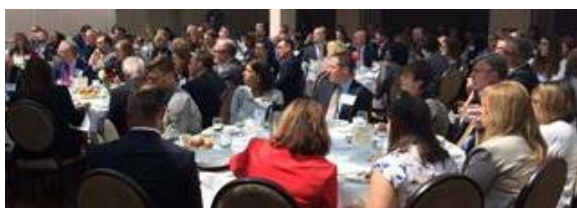
Participants enjoying the WHN Newsmakers event

The panel spoke to Wisconsin's leading health system and hospital leaders about the issues facing their industry now and in the future.