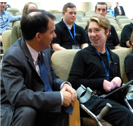
Gov. Scott Walker talks to a Project SEARCH intern at Mayo Clinic Health System in Eau Claire April 10.

Gov. Scott Walker visited three hospitals to highlight the success of workforce development initiatives, such as Project SEARCH that work to employ people with disabilities. Walker visited HSHS St. Vincent Hospital in Green Bay, Aspirus Riverview Hospital in Wisconsin Rapids, and Mayo Clinic Health System in Eau Claire. Project SEARCH teaches students marketable, transferable and competitive skills to help them transition into Wisconsin's workforce. Several Wisconsin hospitals and health systems in the state support Project SEARCH.