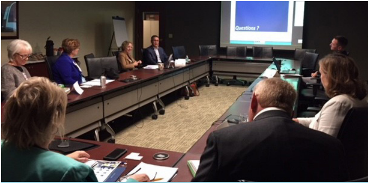
WHA's Council on Workforce Development meeting, October 4