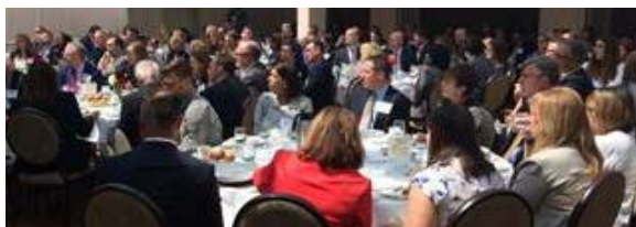
Participants enjoying the WHN Newsmakers event

The panel spoke to Wisconsin's leading health system and hospital leaders about the issues facing their industry now and in the future.