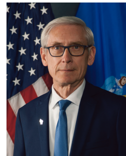
Gov. Tony Evers

Gov. Tony Evers is confirmed as a speaker at the Wisconsin Hospital Association's (WHA's) 2021 Advocacy Day on April 14. The event is perfectly timed as legislative action is taking place on the state budget, offering hospital representatives and supporters an excellent opportunity to engage on important health care issues with their elected representatives.