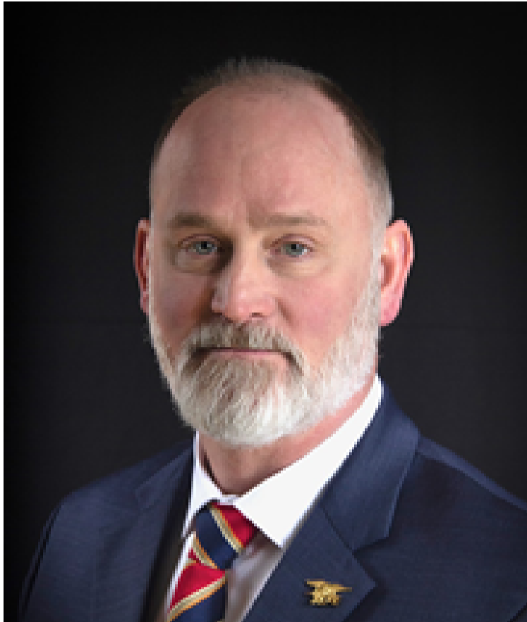
Rep. Derrick Van Orden

In Wisconsin, Republican Derrick Van Orden successfully flipped the Third Congressional District to GOP control, retaking a seat that had been held by retiring Democrat Ron Kind for 26 years. All incumbent members of Wisconsin's House Congressional delegation cruised to re-election, meaning there will be six Republicans and two Democrats representing the House of Representatives for Wisconsin in 2023-2024.