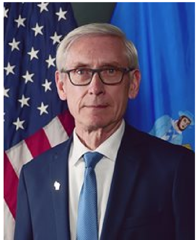
Gov. Tony Evers